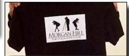
Dark Shirt Transfer