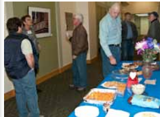
A fine spread of appetizers complemented the show

The January meeting was preceded by the Artists' Reception for the club's first 2011 gallery show, "My Favorite..." Members and guests gathered in the main hall of the Community & Cultural Center (CCC) to admire the photos, munch on appetizers, and chat with the photographers.