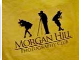
Light Shirt Transfer